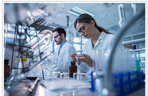
The new UA Graduate Certificate in Regulatory Science teaches how to navigate the path from research to bringing a medical product to the market.