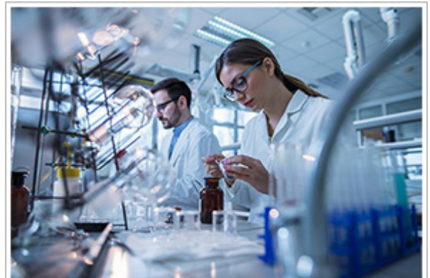
The new UA Graduate Certificate in Regulatory Science teaches how to navigate the path from research to bringing a medical product to the market.